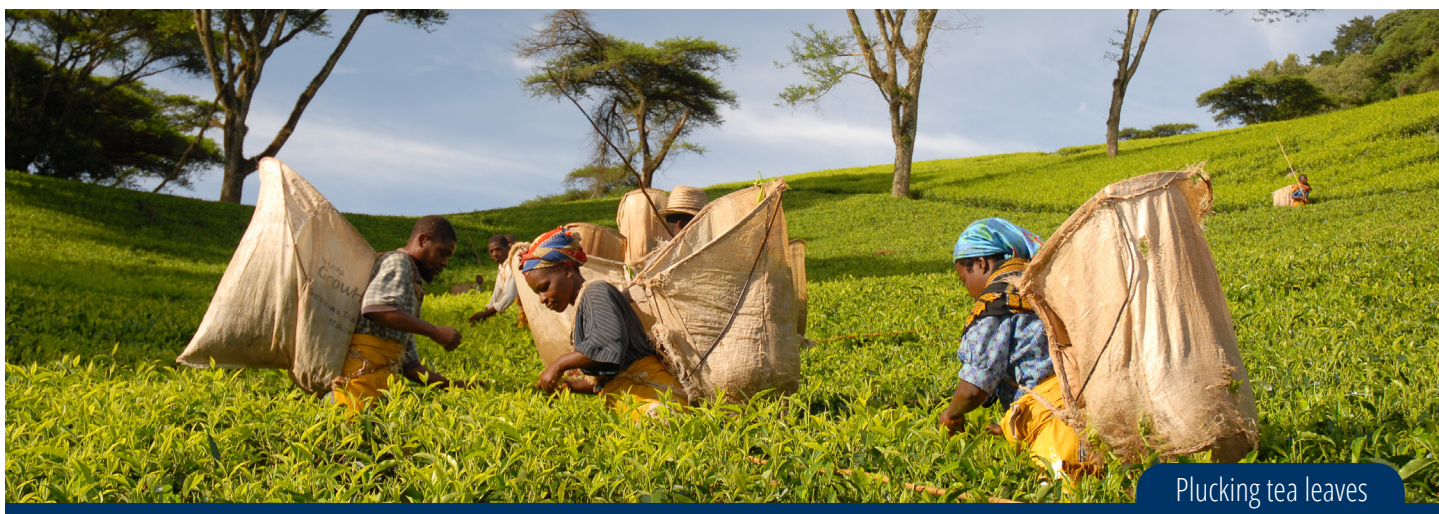
Plucking tea leaves