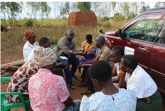
Community Listening Group