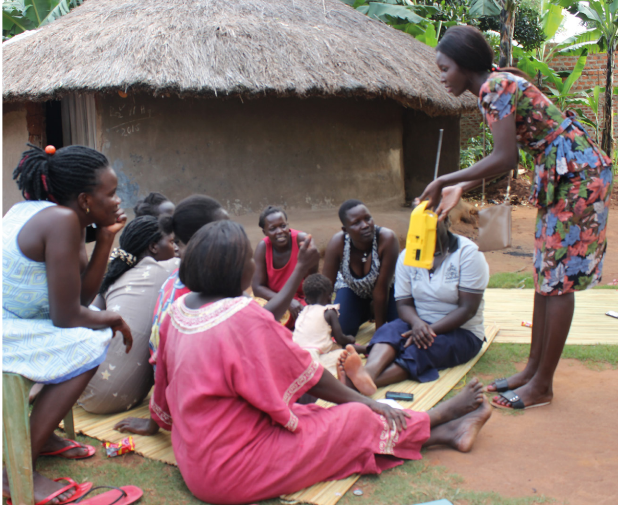
FARM RADIO INTERNATIONAL

Farm Radio International staff training a group of female poultry farmers in Gulu, northern Uganda, on how to record their voices to be played on air